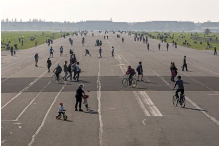
urbainable – stadthaltig Former runway at Tempelhof Field, Berlin, 2017

Press images are provided free of charge solely for the current coverage of the exhibition. The images may neither be modified, cropped or overprinted. Any such changes to the images are only possible with prior permission in writing. Publishing on social media platforms and transfers to a third-party are not permitted. Press images are to be deleted from all online media four weeks after an exhibition has ended. Specimen copies are requested and should be sent unsolicited to the Press Office. For login details for downloads please contact +49 (0)30 200 57-1514 or send an e-mail to presse@adk.de .