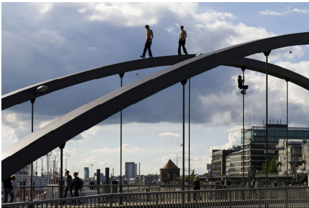
urbainable – stadthaltig Niederbaumbrücke (Niederbaum Bridge), Hamburg, 2010