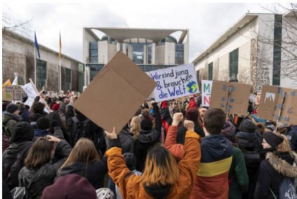
urbainable – stadthaltig Fridays for Future demonstration outside the Federal Chancellery, Berlin, 2019