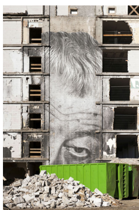
urbainable – stadthaltig Wrinkles of the City street art by JR on the corner of Breite Straße and Leipziger Straße (former Ministry of Building of the GDR), Berlin, 2014