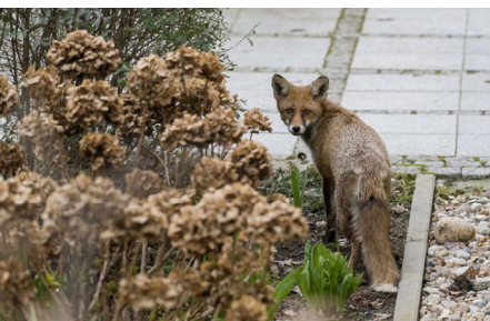
urbainable – stadthaltig Fox on the doorstep, Berlin, 2017