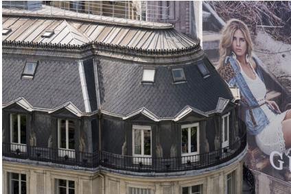
urbainable – stadthaltig Paris, 2017

Press images are provided free of charge solely for the current coverage of the exhibition. The images may neither be modified, cropped or overprinted. Any such changes to the images are only possible with prior permission in writing. Publishing on social media platforms and transfers to a third-party are not permitted. Press images are to be deleted from all online media four weeks after an exhibition has ended. Specimen copies are requested and should be sent unsolicited to the Press Office. For login details for downloads please contact +49 (0)30 200 57-1514 or send an e-mail to presse@adk.de .