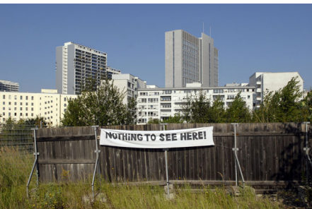
urbainable – stadthaltig Nothing to see here, Berlin, 2007