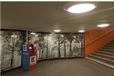
urbainable – stadthaltig Cash machine at Hallesches Tor underground station, Berlin, 2017