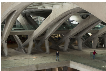
urbainable – stadthaltig Estação do Oriente railway station, Lisbon, 2016