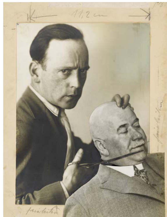
4 – John Heartfield, Self-Portrait , 1929. © The Heartfield Community of Heirs / VG Bild-Kunst, Bonn, 2020, Akademie der Künste, Berlin