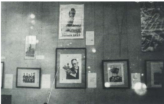
3 – John Heartfield, Installation view of John Heartfield's solo exhibition, Moscow, 1931