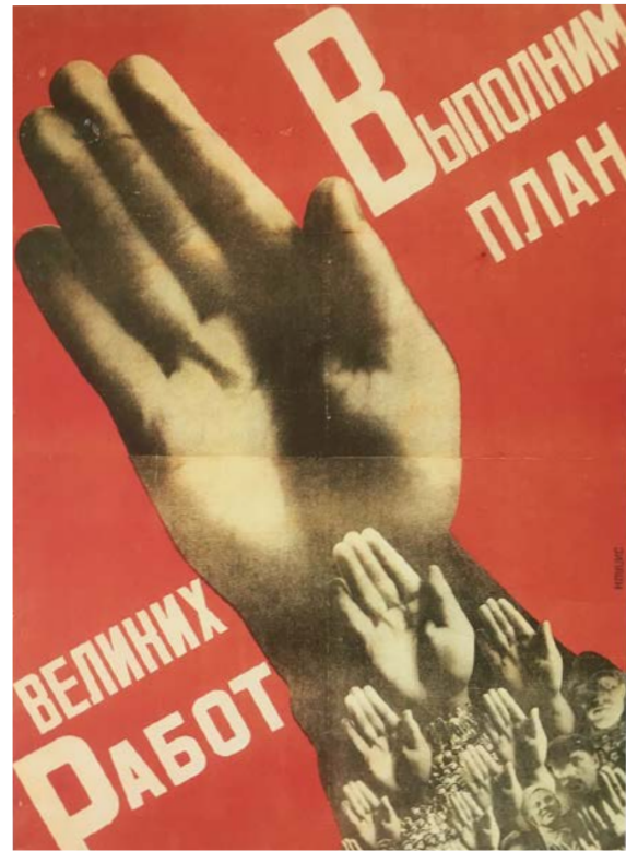
5 – Gustav Klutsis, Let’s Fulfill the Great Projects , 1930, Margarita Tupitsyn Archive